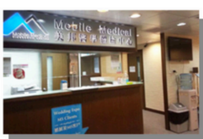
Tsuen Wan West (New Territories)