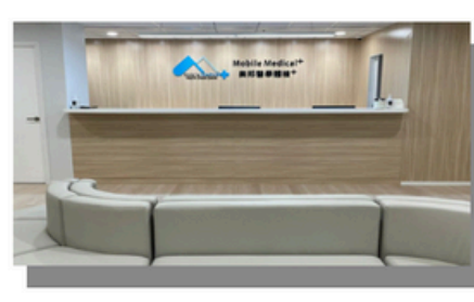
Yuen Long (New Territories West)