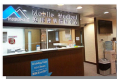
Tsuen Wan West (New Territories)