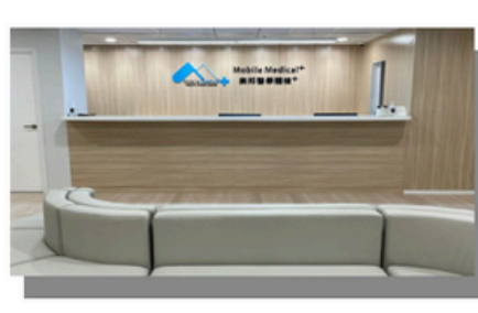
Yuen Long (New Territories West)