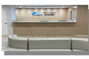
Yuen Long (New Territories West)