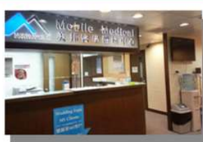
Tsuen Wan West (New Territories)